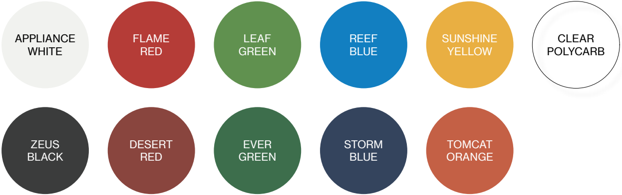
BACKBOARD COLOUR OPTIONS