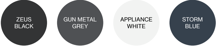
POLE (POST, OUTREACH & BACKBOARD FRAME) COLOUR OPTIONS

Backboard Dulux Duratec Powdercoat or Clear Palsun Polycarbonate