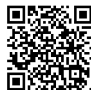
Waterborne Woodsman SDS

Please ensure the current Data Sheet is consulted prior to specification or application of Resene products. View Data Sheets online at www.resene.com/datasheets . If the surface you propose to coat is not referred to by this Data Sheet, please contact Resene for clarification.